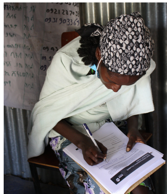
Signing up a consent for the interview