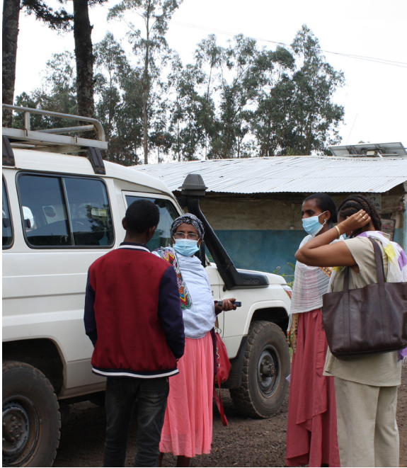
Ambulance is stand by to transport fistula patients to and from the health facilities.