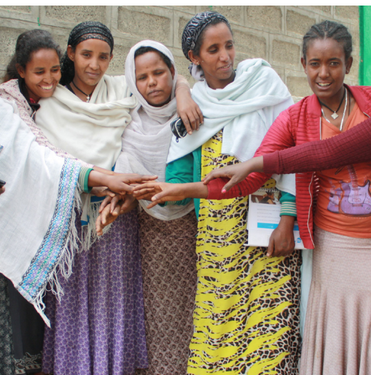
Together, they muster energy and make a difference in fighting fistula.